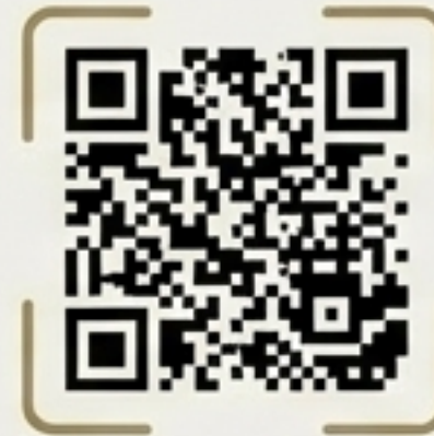
The Stern Watch Radio

Music Downloads: music.thehouseofbread.co.za