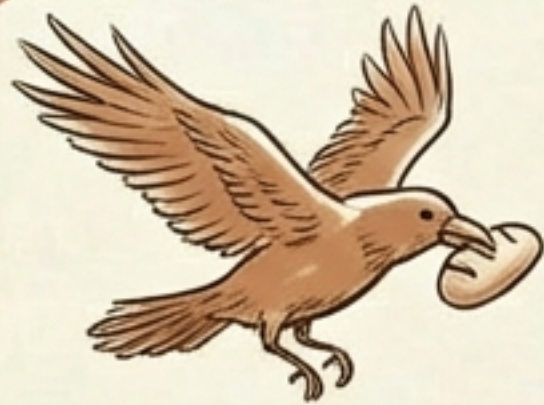
Elijah at the Brook